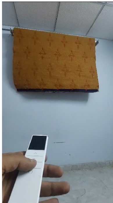
Blinds with Smart Automation