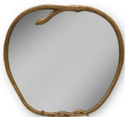
SERPENTINE II | MIRROR

Exquisite new designs will be shown for the first time in the US including the plush curving Luscious Sofa with rippling pleats and provocative metal detailing, the exotic oval Serpentine II Mirror featuring a hand-carved sculptural snake frame (selected for the High Point trend room!), and the chic Denise Chair featuring a slender layered frame which perfectly cups its guest.