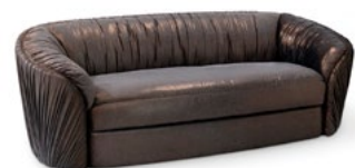
LUSCIOUS | SOFA