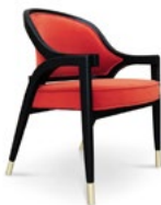
ARENDAAL | CHAIR