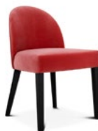
CHICAGO | CHAIR