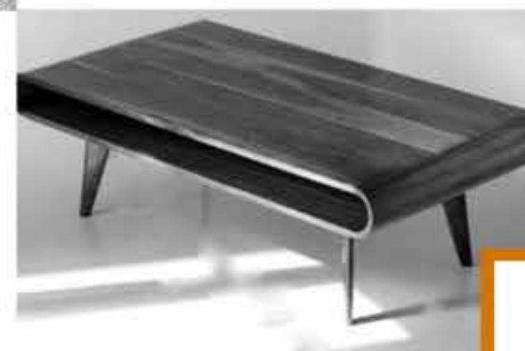
11 SCANDO The arching curves and exaggerated flowing lines earn its iconic mid-century modern status. Made to emulate original design. $300. Overstock.com