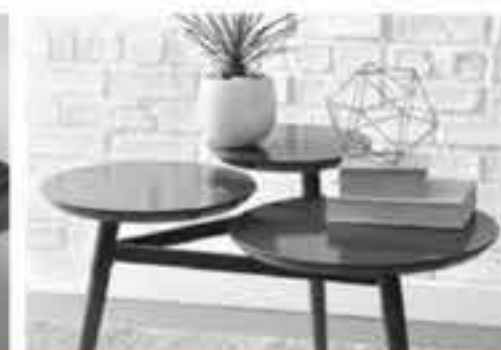
9 ATHY DESIGN Select the side, wood variegation, and finish on this shapely handmade table. Starting at $2,100. Etsy.com