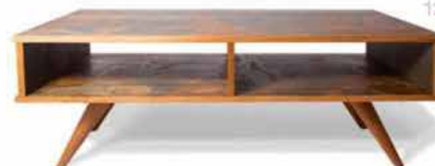
12 VERA A solid white-oak coffee table in mid-century modern style. Tables are made-to-order and can be customized for size and color. 1429mfg.com