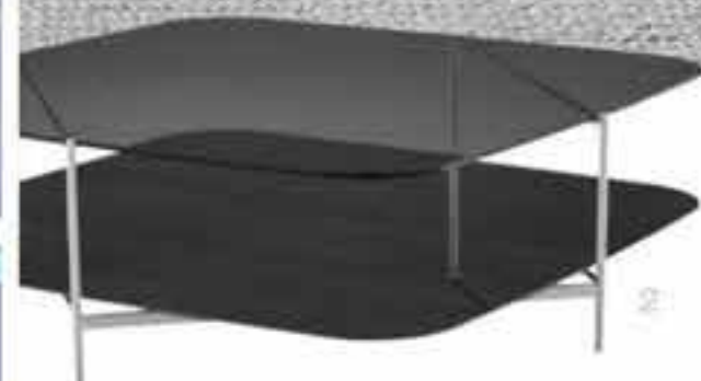
2 CLYDE An opaque lower tier can be seen below a smoked-glass top, bound together with brass-plated steel. $1,287. Ligneroet.com