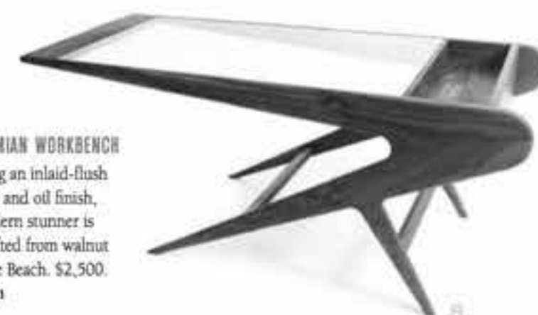
8 BOHEMIAN WORKBENCH Featuring an inlaid-flush glass top and oil finish, this modern stunner is handcrafted from walnut in Venice Beach. $2,500. Etsy.com