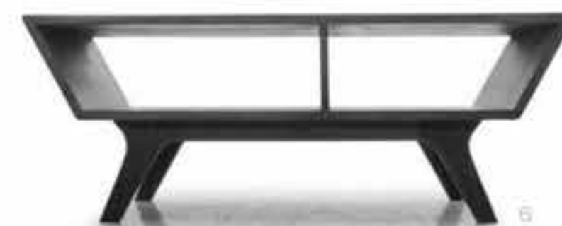
6 BRENNAN With each curve of its Space Age silhouette, this nouveau-retro coffee table refuses to fade into history. $1,099. Joybird.com